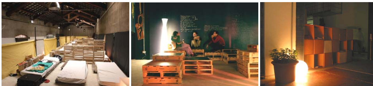
The designers' house – past editions

Finding solutions to real deficiencies; upgrading facilities and services; and changing common attitudes towards others - these are various challenges sharing the same goal, i.e. turning Milan into an international, open, welcoming and friendly city.