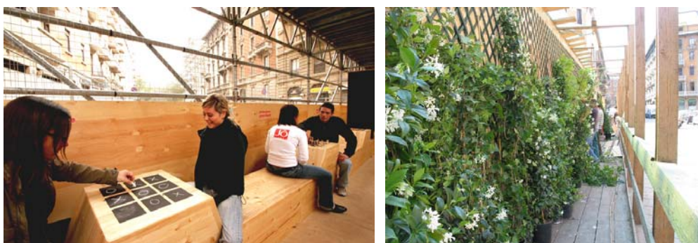
Cantieri Aperti - Open Construction Sites