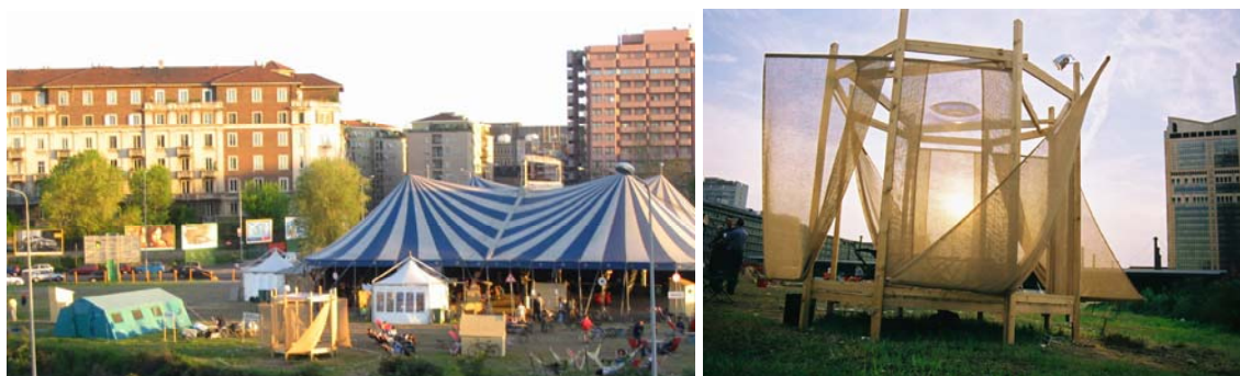
Design Pubblico 2004 – Città in Rivoluzione

All these projects, and many others tested in public areas for years, will be collected in a catalogue of public design (online at www.designpubblico.it ). This will be distributed before, after and during the week dedicated to Milan International Furniture Show: it will contain ideas that could take shape non just once, but in countless places and situations.